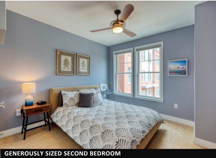
GENEROUSLY SIZED SECOND BEDROOM

Two assigned parking spaces in an underground garage are accessed through a private entrance from your condo offering a unique level of convenience and exclusivity for buyers who prioritize easy access and enhanced security. Completing the high value features of this magnificent condo are 3 climate-controlled, secure storage rooms.