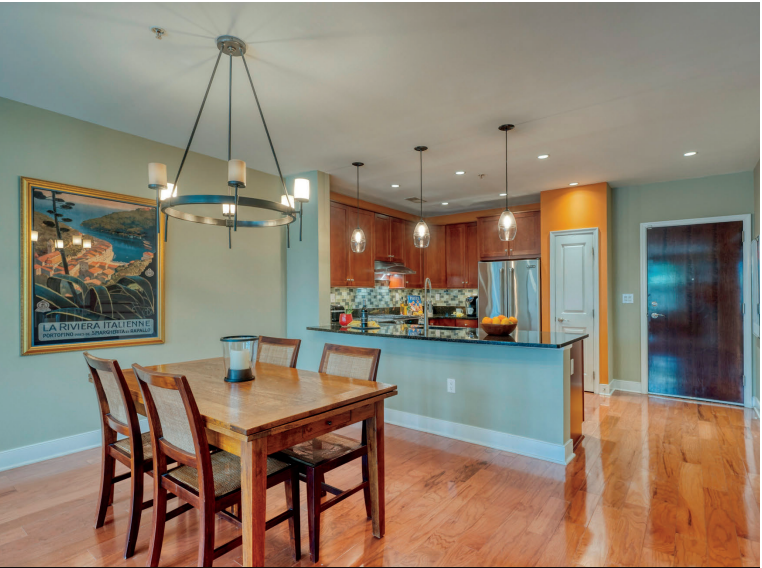
ADJACENT DINING AREA FOR ENTERTAINING OR DAILY MEALS