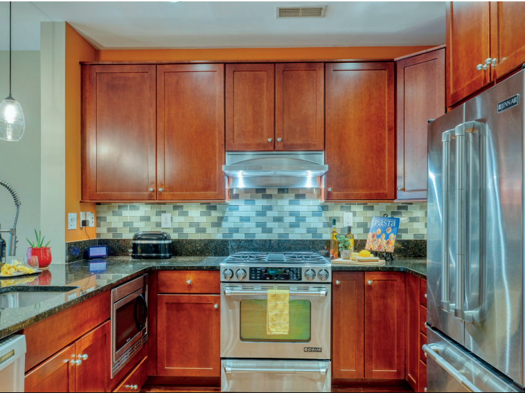
SPACIOUS GOURMET KITCHEN WITH AN ABUNDANCE OF STORAGE