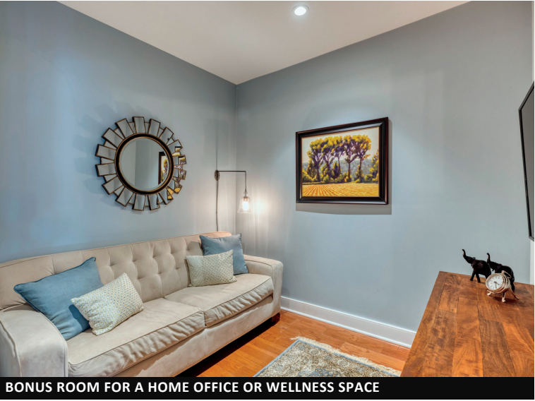
BONUS ROOM FOR A HOME OFFICE OR WELLNESS SPACE