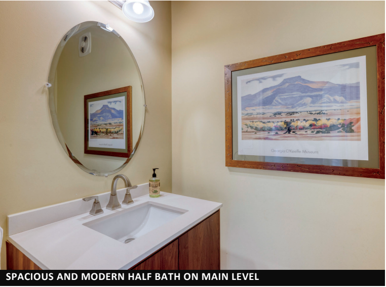
SPACIOUS AND MODERN HALF BATH ON MAIN LEVEL