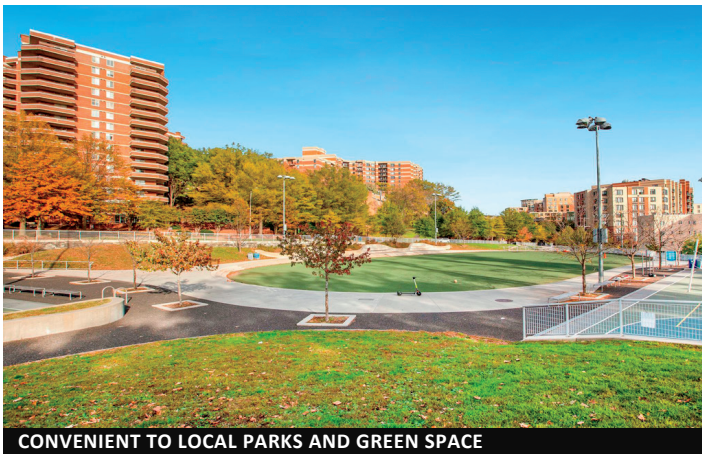
CONVENIENT TO LOCAL PARKS AND GREEN SPACE