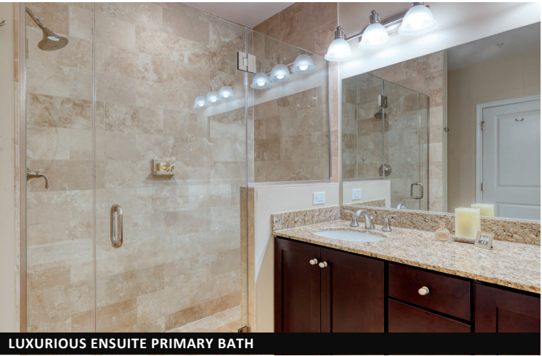
LUXURIOUS ENSUITE PRIMARY BATH