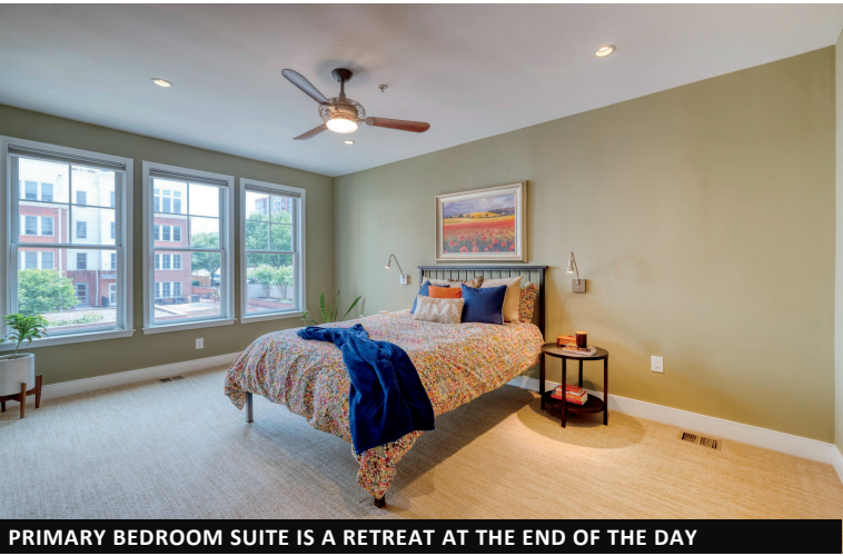
PRIMARY BEDROOM SUITE IS A RETREAT AT THE END OF THE DAY