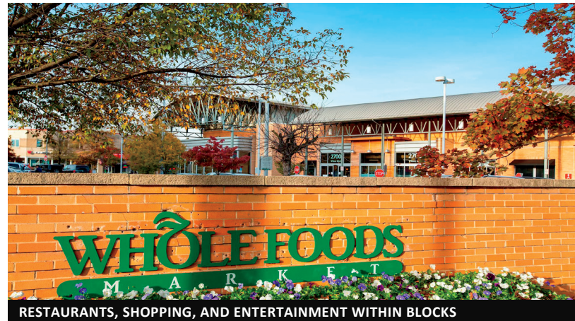
RESTAURANTS, SHOPPING, AND ENTERTAINMENT WITHIN BLOCKS