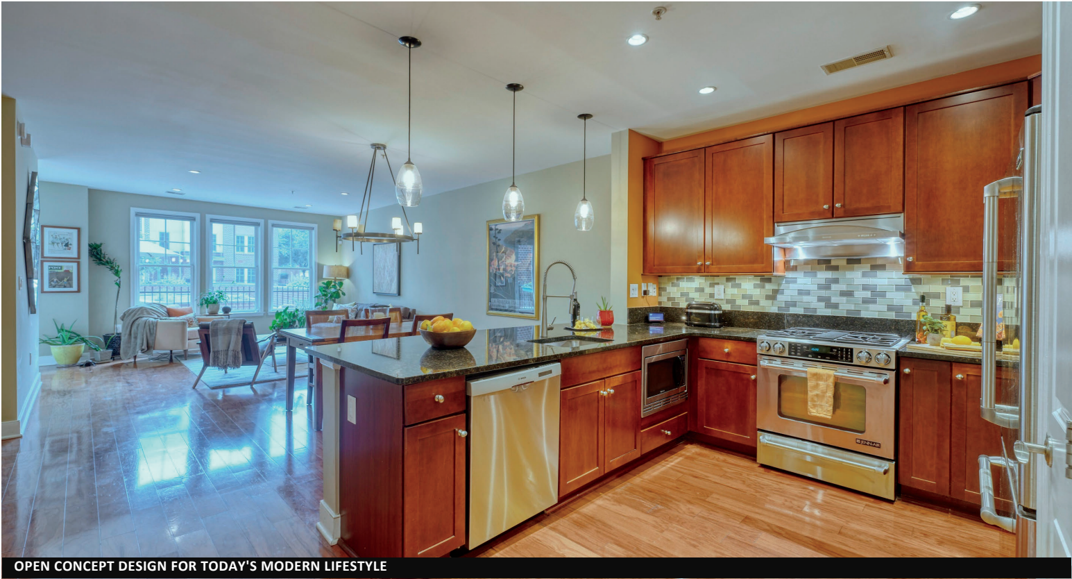
OPEN CONCEPT DESIGN FOR TODAY'S MODERN LIFESTYLE