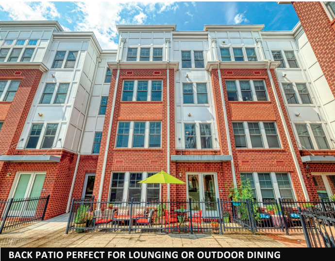
BACK PATIO PERFECT FOR LOUNGING OR OUTDOOR DINING