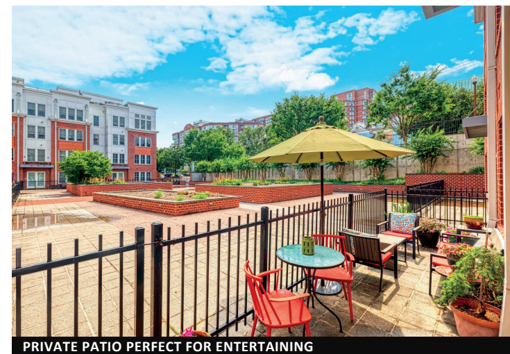
PRIVATE PATIO PERFECT FOR ENTERTAINING